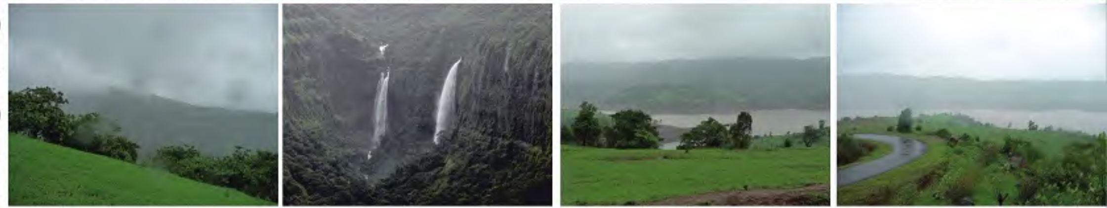
Actual view from site